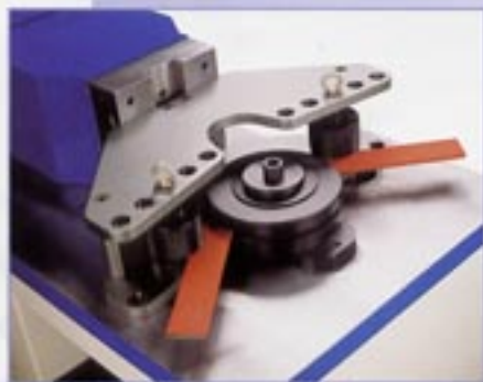
Flat plate edge bending tool for up to 50mm(w)x12mm(t)