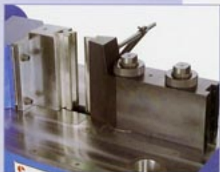
Multi-vee bending tool for thin plate