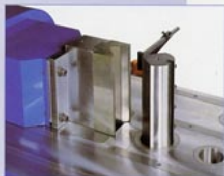
Single-vee bending tool for thick plate